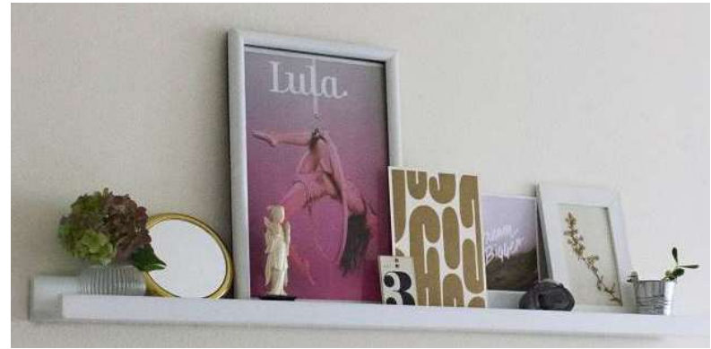
The designer: elegant & artistic

https://www.smartfurniture.com/blog/post/show-shelfie