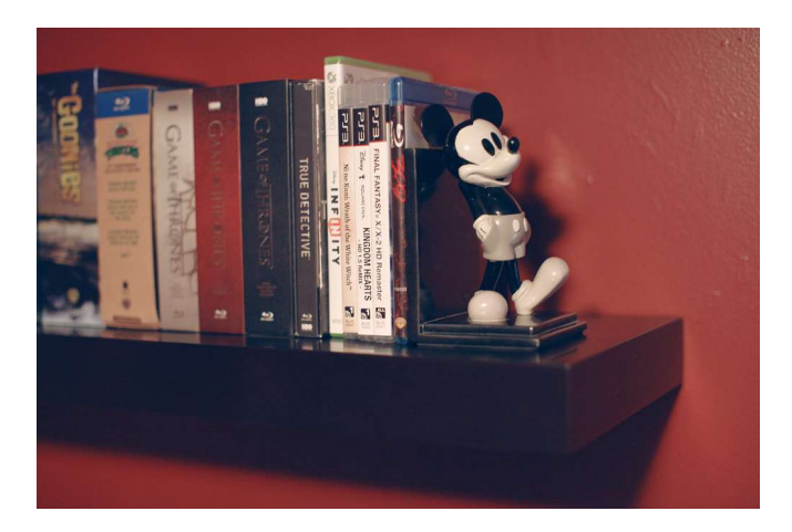
The Media Aficionado: I watch intense psychological thrillers and Mickey Mouse. You don't?