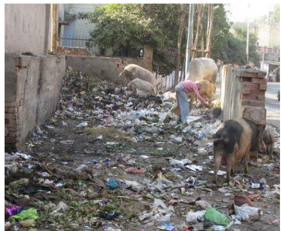
Feed me - Agra