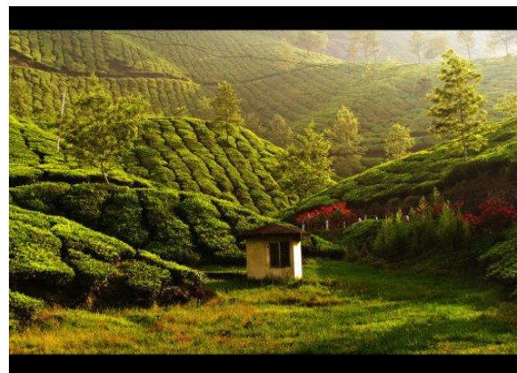
Tea estate in Munnar