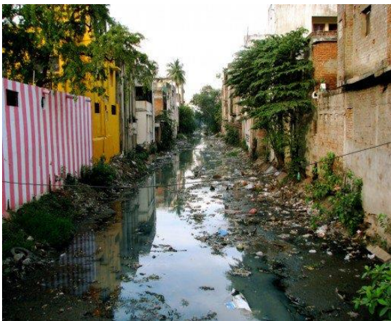
Canal in Chennai